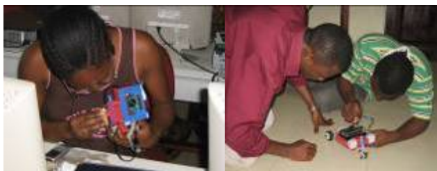
Figure 2: Ashesi students working on a project

computer science education in Ghana. Robotics, however, is a new topic for Ashesi where no engineering program is currently offered. Through a partnership with TechBridgeWorld [14] at Carnegie Mellon University, an introductory course in robotics and artificial intelligence (AI) was piloted during the summer of 2006. The course design was based on the authors' experience of teaching the "Autonomous Robots" course in Qatar. To our knowledge, this course titled "Introduction to Robotics and Artificial Intelligence" was the first undergraduate robotics course in Ghana. It aimed to enhance the students' technical creativity and problem solving abilities by engaging them in hands-on projects while introducing them to the exciting field of robotics. Another goal was to expand the students' perception of the breadth of Computer Science and to expose them to a wider range of knowledge and skills that could be applied to the problems they would encounter in their future careers.