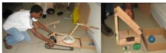
Figure 3: Building machines from local materials

coordination. Students completed four tasks and three short quizzes during the first five weeks of the course, and a final project in the last four weeks. The bulk of each task was a hands-on activity designed for teams of two or three students. Their first task was to build a machine to deliver a small ball to a goal using materials locally available within a very small budget. Students utilized plywood, bicycle parts, cans, motors, and rope, among other materials for this assignment. The next three tasks required students to construct a Lego robot, program it to execute basic motion patterns, add sensors to allow navigation through a maze, and implement a wave-front planning algorithm to navigate an environment with obstacles.