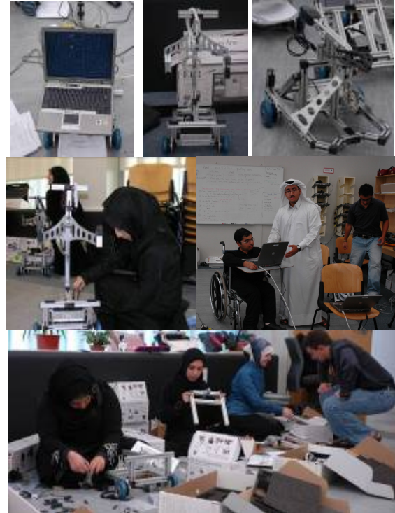
Figure 1: CMU-Q students working on a project and student-assembled robots

Lecture topics included kinematics, control, sensing and perception, path planning, machine learning, machine vision, manipulation, and team coordination. Some lectures were also dedicated to discussing on-going research in Robotics, and potential Robotics careers and applications in Qatar. The homework assignments followed the lecture material closely and were used to assess the students' understanding of theoretical concepts. The lab assignments required students to install Linux on their laptops and construct their robots from the kits, with a design of their choice, and then use these robots to implement several capabilities. These capabilities included a simple potential field reactive navigation system, a state-machine based behavioral controller to solve a simple game of knocking down blue fiducials, while spinning to 'identify' red ones, and a coordination mechanism to allow two robots to autonomously rotate and move a box a distance of 1m. These assignments were completed by mid-semester, and the remaining time was dedicated to the student's final projects. The final projects were formulated based on student interests and topics ranged from soccer-playing robots and robots responding to traffic signals, to entertainment and assistive robotic projects. Some projects focused on algorithms for path planning, while others emphasized the application of sensing and machine learning.