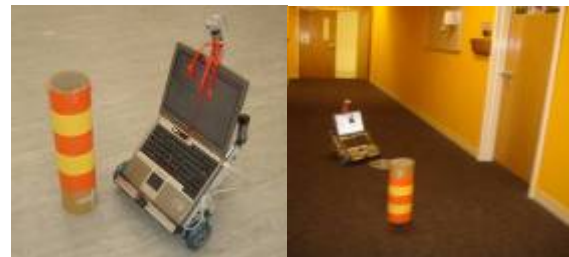
Figure 5: Mishwar, the tour-guide robot

We now examine the impact on the students and community of these two courses in the period since they were taught.